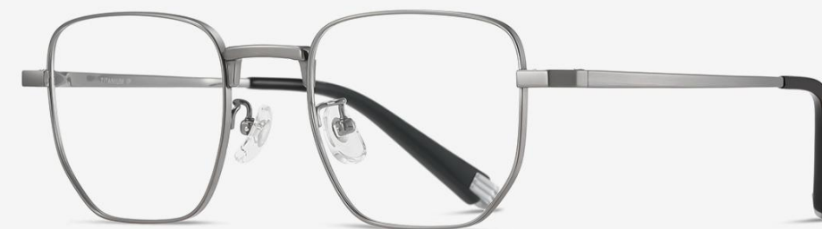
N0.3 亮浅枪拉丝 C5