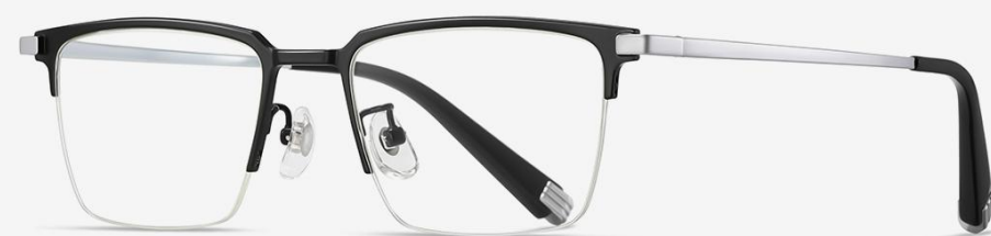
N0.1 哑黑/银 C2