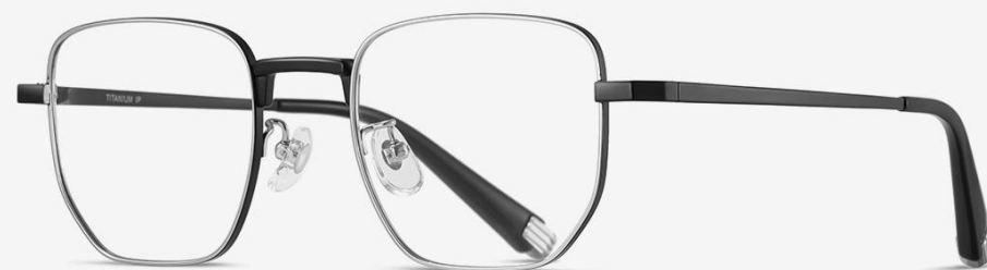
N0.1 亮银 C2