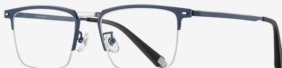
N0.2 哑蓝/银 C6