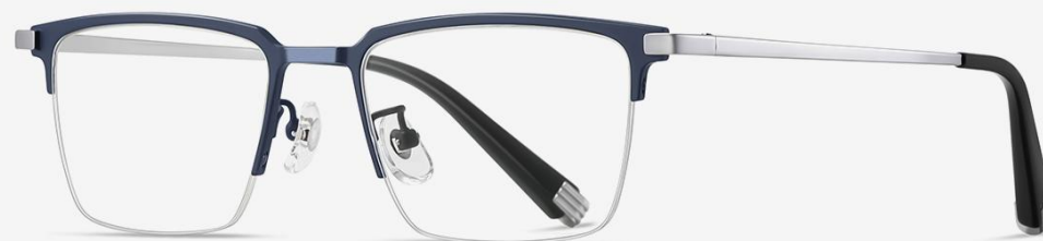
N0.2 哑蓝/银 C6