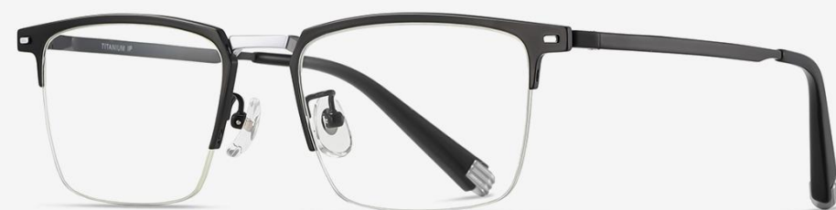
N0.1 哑黑/银 C2