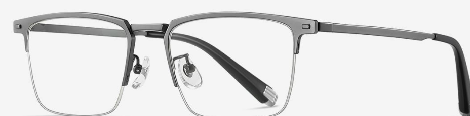
N0.3 哑深枪 C7