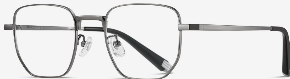
N0.2 亮深枪 C3