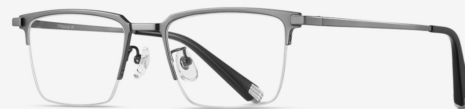
N0.3 哑深枪 C7