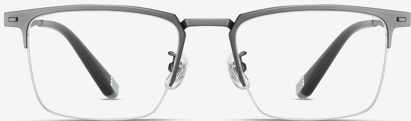
▲ LF9021 Size : 53-19-147