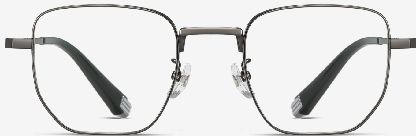
▲ LF9014 Size : 49-21-147